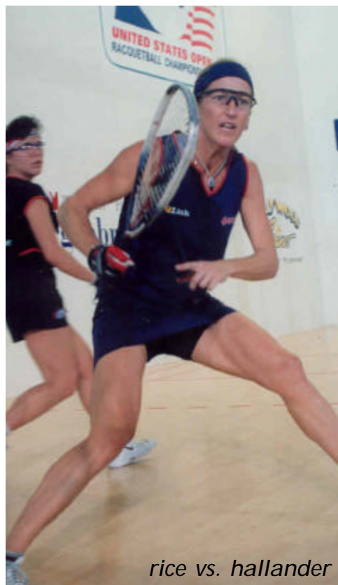
rice vs. hallander